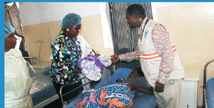
UNFPA donates Maternal Reproductive Health kits to PCMH