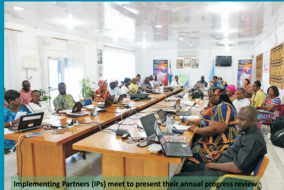
Implementing Partners (IPs) meet to present their annual progress review

One of the key strategies adopted by the CO in this regard, has been the recognition of high-performing IPs through the Performance Improvement Recognition Initiative, or PIRI as it is known in the office.