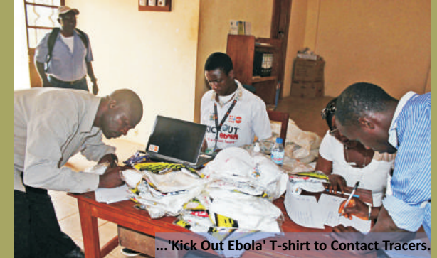
...'Kick Out Ebola' T-shirt to Contact Tracers.