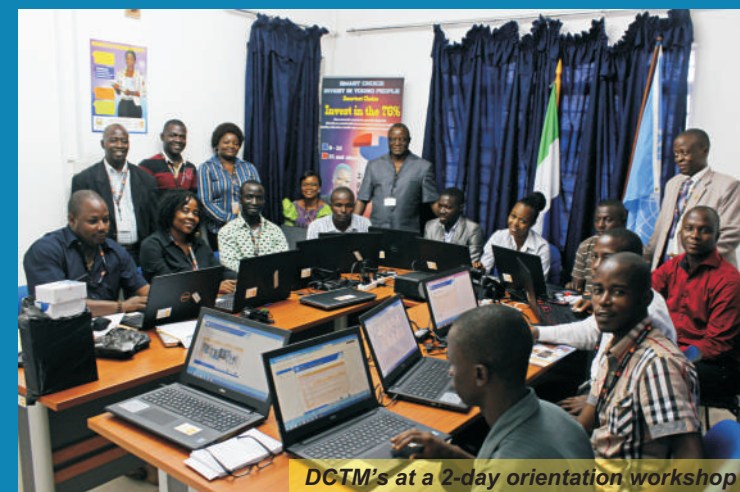
DCTM's at a 2-day orientation workshop

The DCTMs were deployed on the 24 th of November, 2014 and their deployment will last for six (6) months.