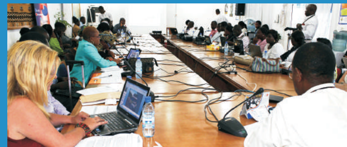
UNFPA SL wins....