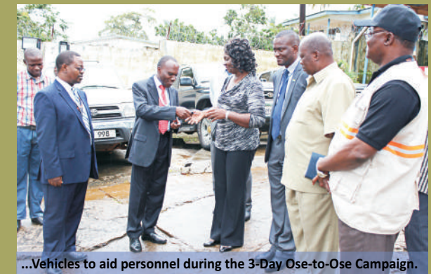
...Vehicles to aid personnel during the 3-Day Ose-to-Ose Campaign.