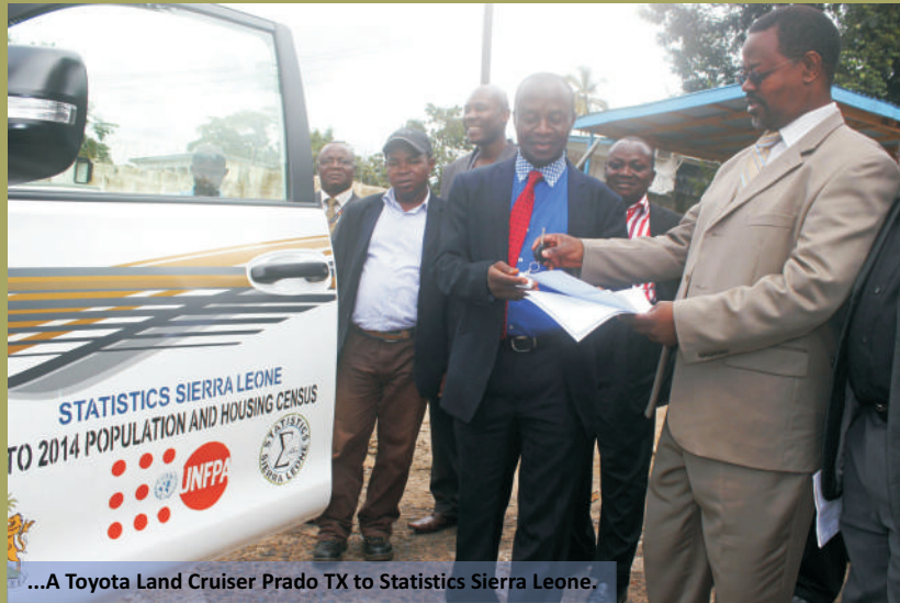
...A Toyota Land Cruiser Prado TX to Statistics Sierra Leone.