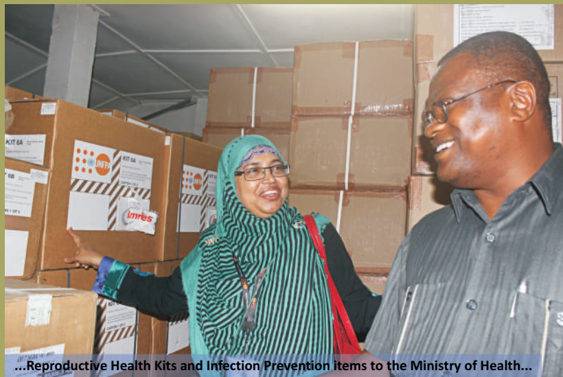
...Reproductive Health Kits and Infection Prevention items to the Ministry of Health...