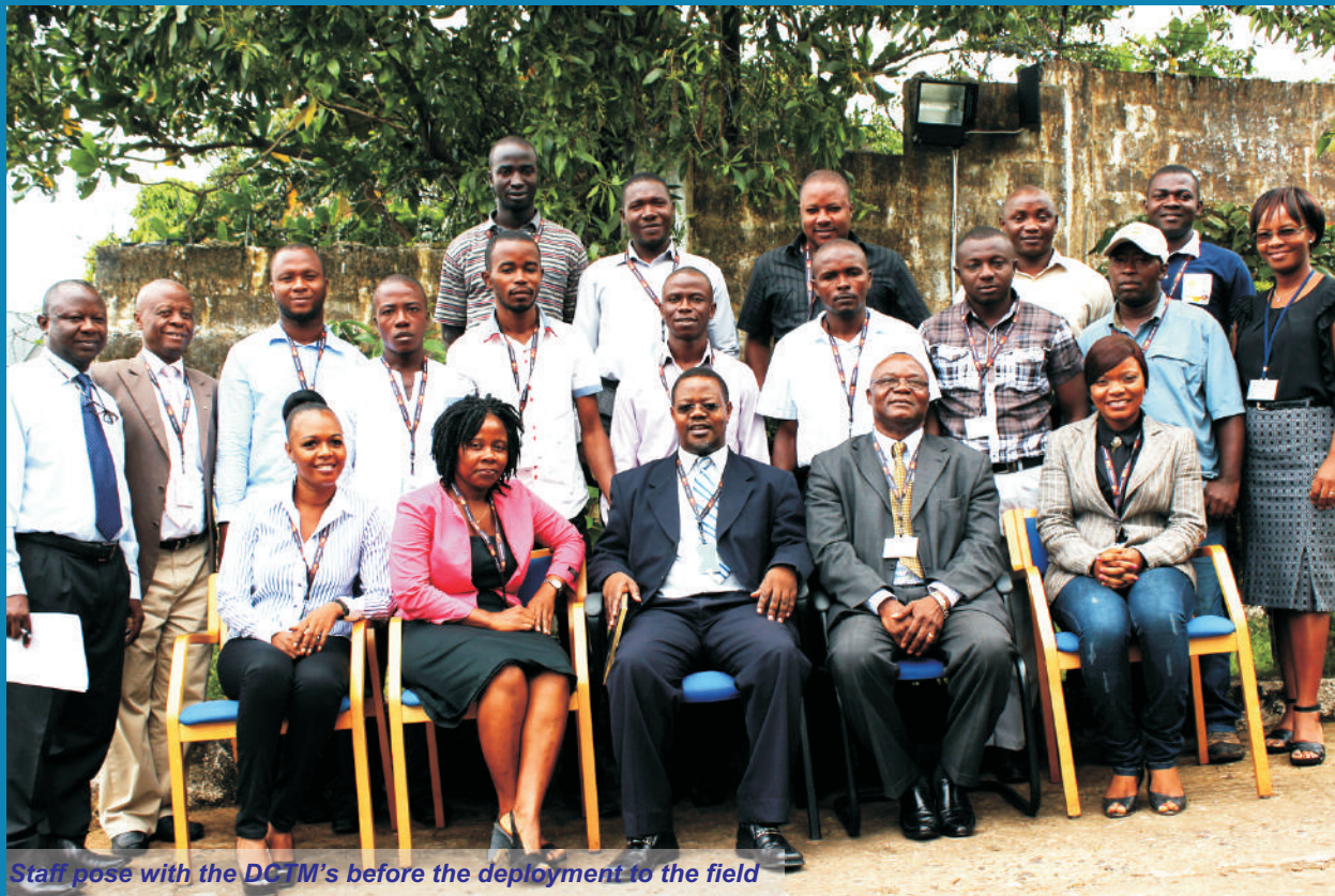
Staff pose with the DCTM's before the deployment to the field

The United Nations Population Fund (UNFPA) deployed 14 District Contact Tracing Monitors (DCTMs) to each of the 14 districts in Sierra Leone to support the Government of Sierra Leone's Ebola Virus Disease (EVD) response. They are to partner with the District Health Management Teams (DHMTs) and oversee management issues affecting Contact Tracing.