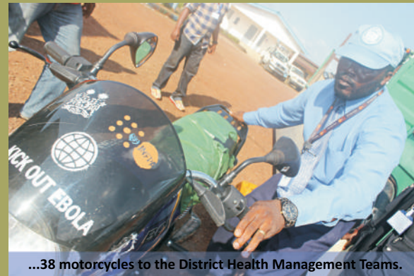
...38 motorcycles to the District Health Management Teams.