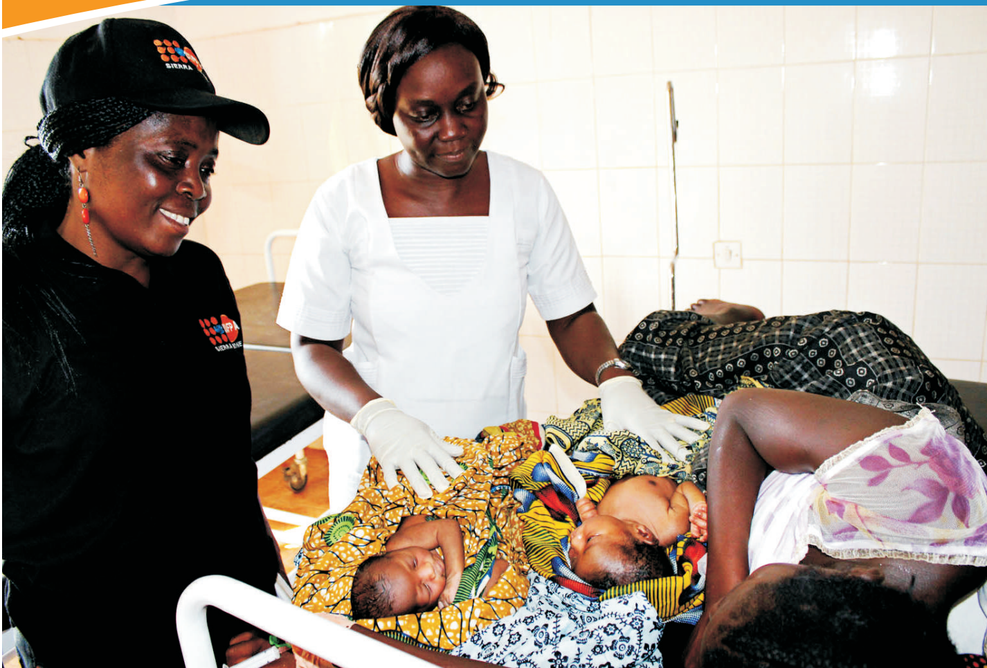
Babies are still being born and UNFPA is here to welcome them