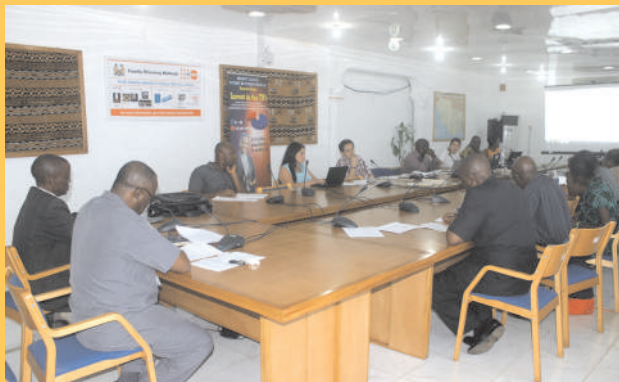
UNFPA heads weekly Contact Tracing and Case Finding Sub-Pillar meetings