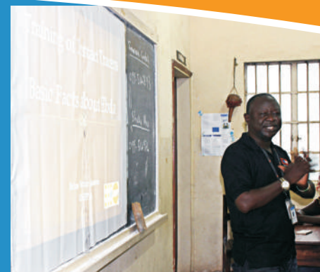
UNFPA trains Contact Tracers