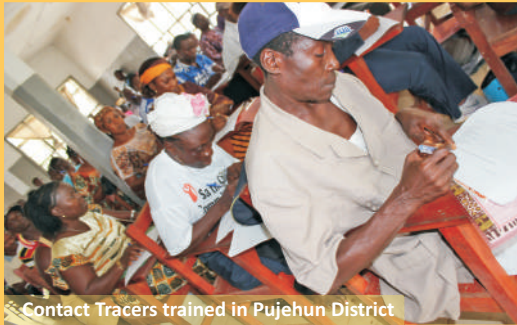
Contact Tracers trained in Pujehun District