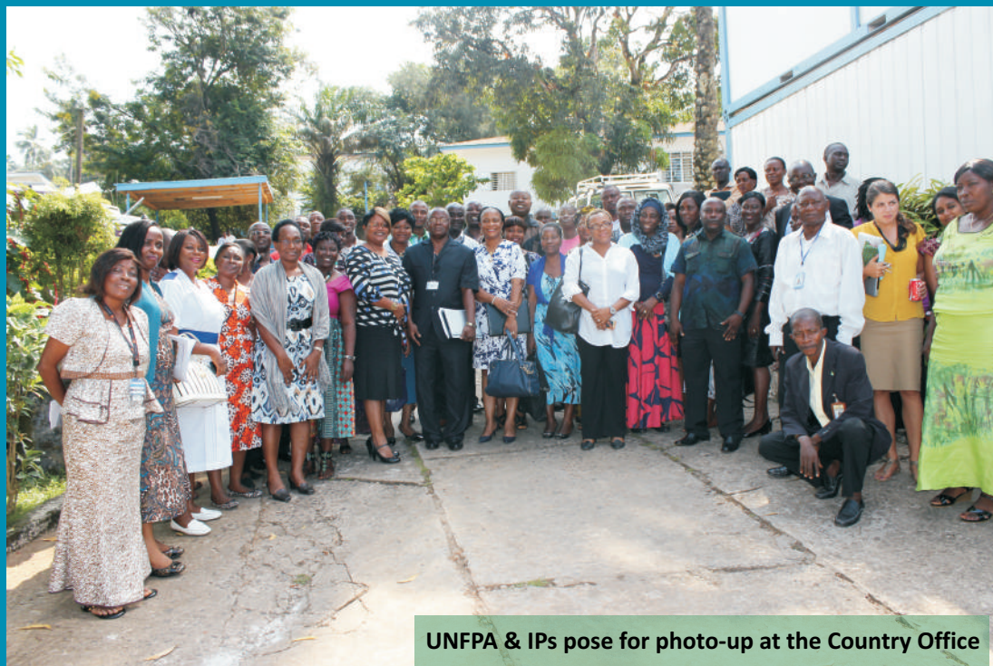
UNFPA & IPs pose for photo-up at the Country Office