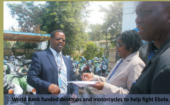
...World Bank funded desktops and motorcycles to help fight Ebola.