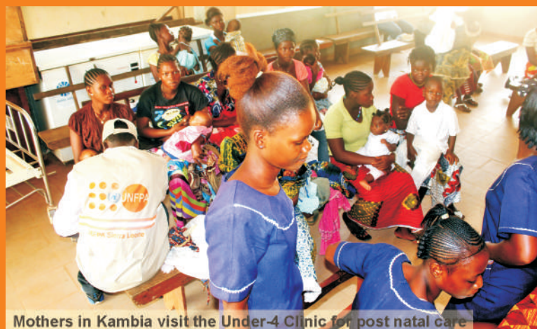
Mothers in Kambia visit the Under-4 Clinic for post natal care

Both projects were signed in December 2014.