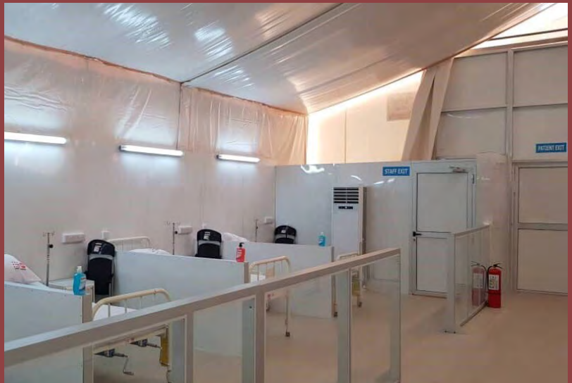
Newly constructed COVID-19 Treatment Centre