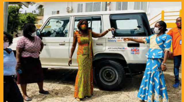
Handover of vehicle to School of Midwifery, Bo

Through this DFID funded Saving Lives programme, four 4x4 wheel vehicles were procured. One each was given to the Schools of Midwifery in Bo and Makeni on the 17th of June.