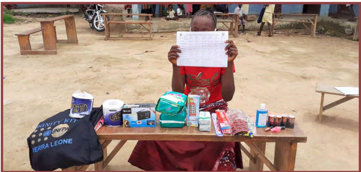
Port Loko girl proudly displays contents of dignity kit

In May, UNFPA distributed 5,448 dignity kits and a further 106 kits in June. These kits were distributed in Kailahun, Kenema, Kono, Port Loko, Western Area, Bo and Bombali districts. To date in 2020, a total of 7,636 dignity kits have been distributed. These kits contain sanitisers and masks, in addition to the routine content of a UNFPA dignity kit. The kits were provided to those most in need including vulnerable adolescent girls. A further 727 sanitary kits containing sanitizers, food and other items have been distributed to boys and men to date.