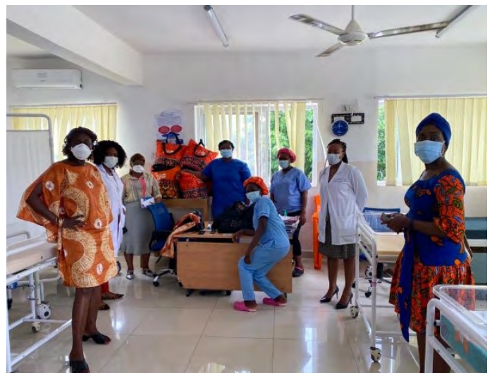
Handover of mama baby packs at King Harman on June 2

On the 17th of May UNFPA Sierra Leone completed a four week Gender-based-violence, Family Planning, Maternal Health, and Coronavirus awareness campaign. The campaign was targeted at Freetown via radio, pre-recorded calls, SMS, and Social Media. All Telephone calls and SMS targeted all 645,000 active Africell subscribers in Freetown with messages in each thematic area.